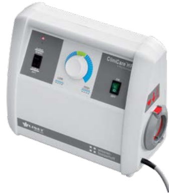
CliniCare 100 HF system control unit (SCU) without Microclimate management MCM.