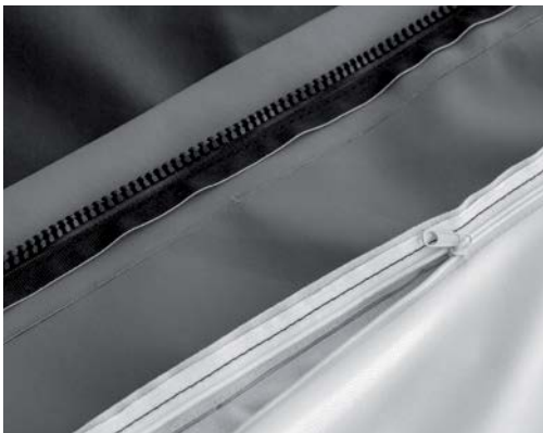
Zipper with protective flap