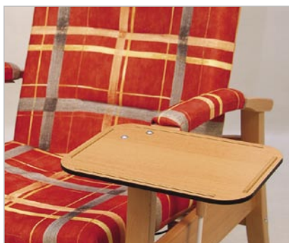
Revolving shelf with enhanced edges