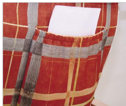
Hand approachable pocket in the back part of the backrest