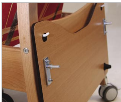
Hook on the back part of the construction for fixation and storage of the eating desk