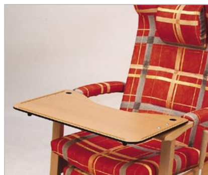
Removable ergonomic eating plate with enhanced edges