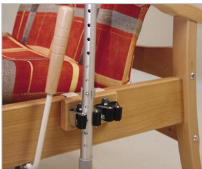
Crutches holder for practical placement of crutches while sitting