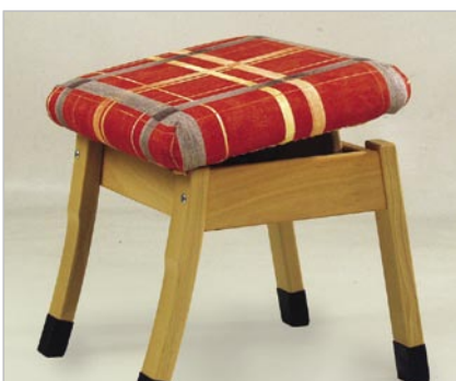
Stowaway footboard with stowage compartment