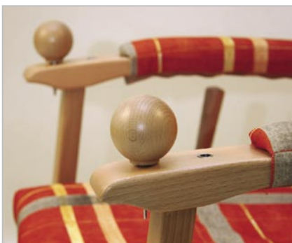
Comfortable and practical removable covers of the armrest