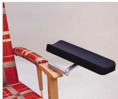
Flexible hand support