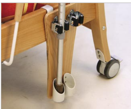
Crutches holder with a holder for easy clamping