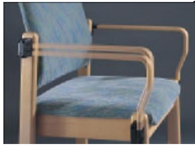
Removable arm rests of oak lamellas, they can be adjusted to two heights, high rigidity of the arm rests provides for sufficient support during standing up. The arm rests can be assembled additionally to all types of SOFTLIN plus chairs.