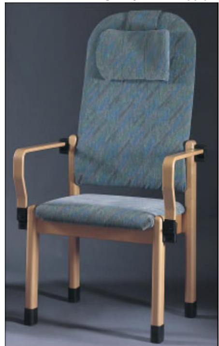
SB 30111 – high (without the head rest – option)