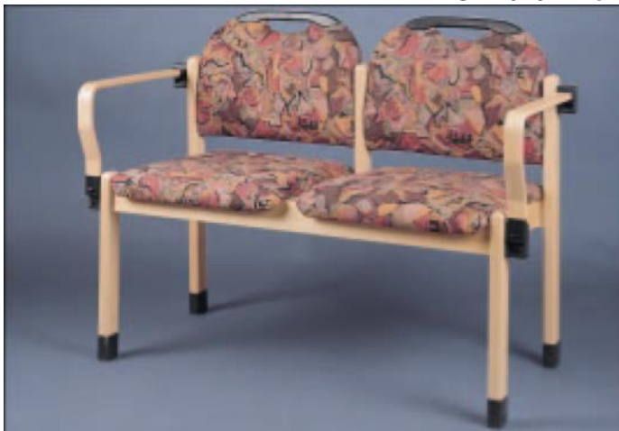
SB 40111 – low double chair