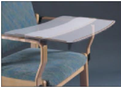
Eating plate positioned on the arm rests (option).