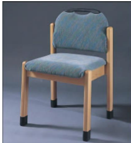
SB 10101 – low