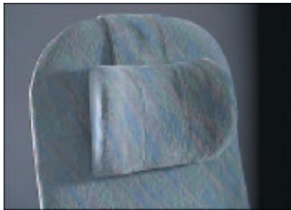
Head rest with adjustable height (recommended with the high back only)