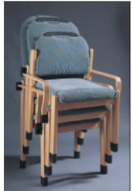
The design of the chairs allows you to stack them even in the case of arm rest models.