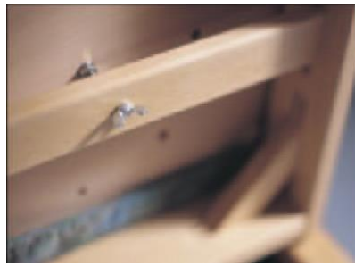
Central nut for easy disassembly of the seat and removal of the overlay.