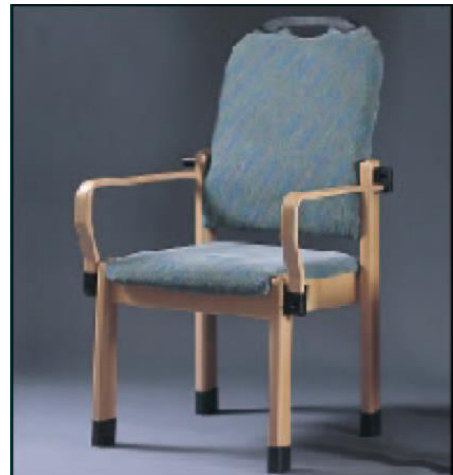
SB 20111 – medium